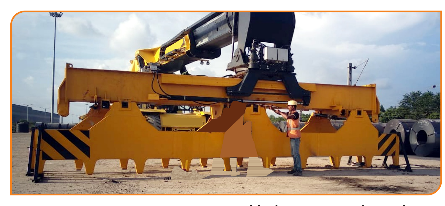
Strong rigid construction, suitable for any reach stacker