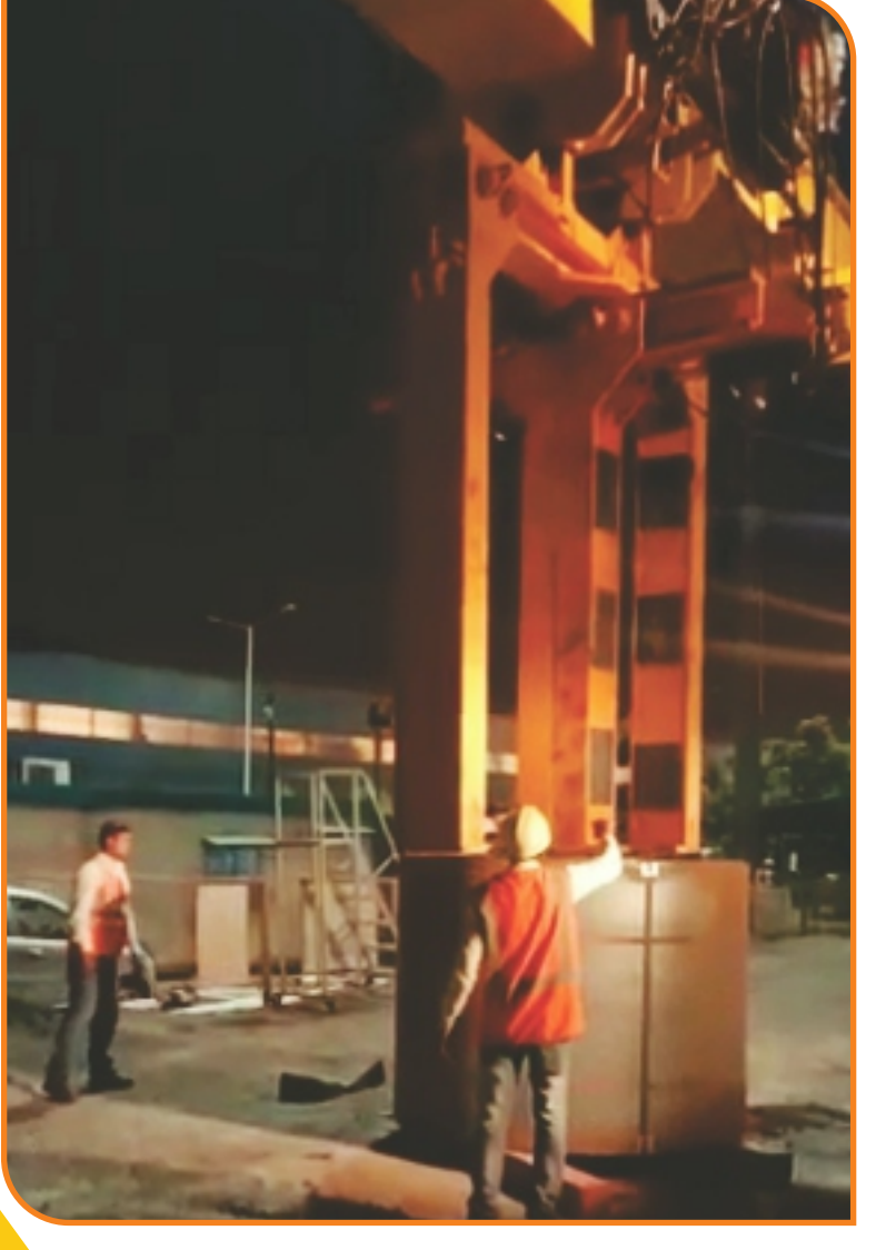
Securing the coil in a safeway