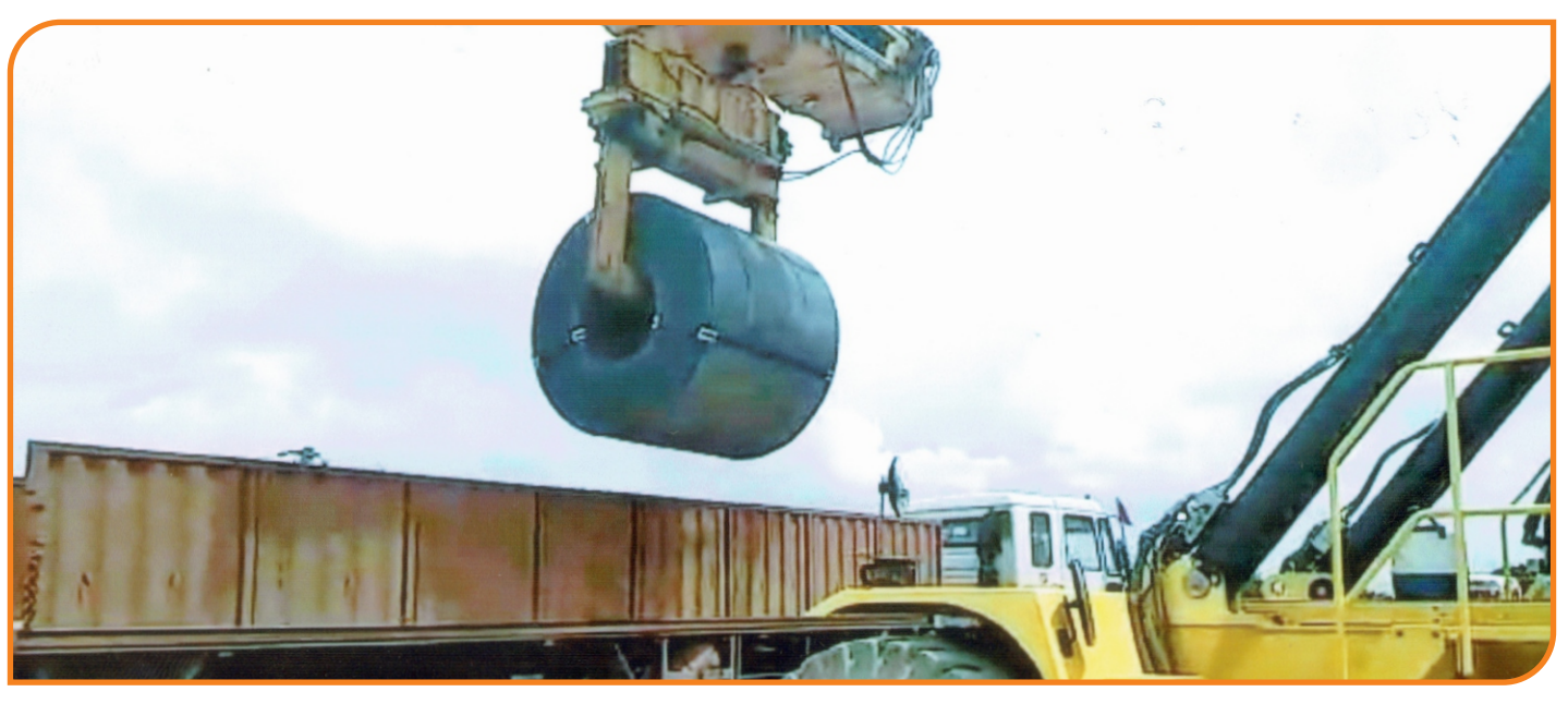
Ease of handling