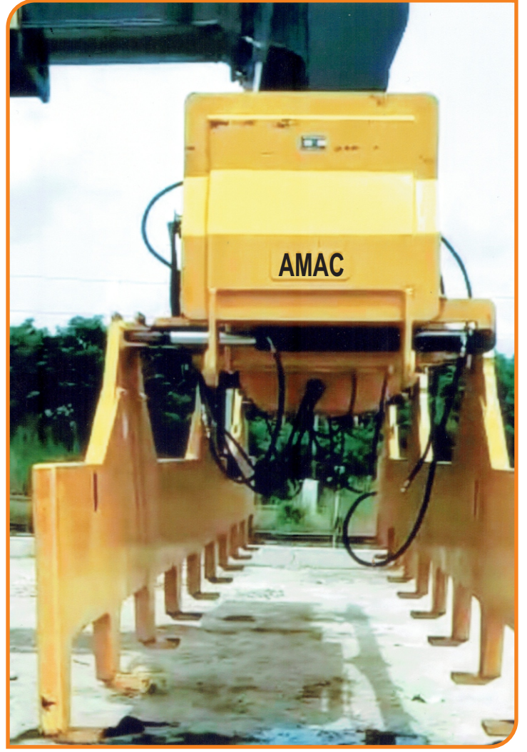
Max. 2.1 mtr. plate width