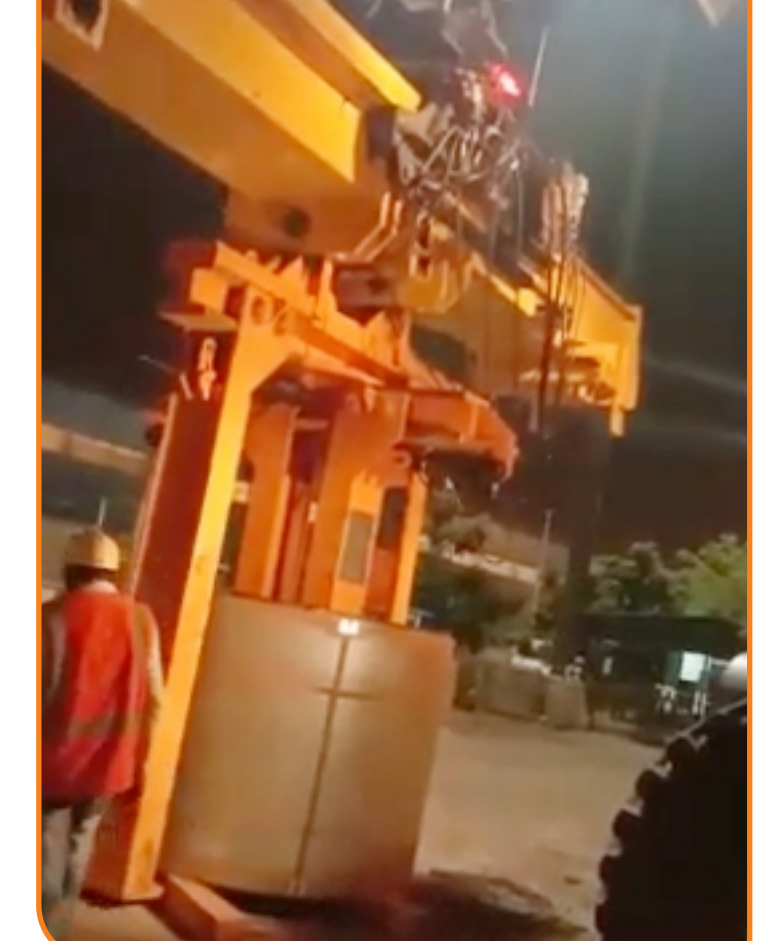
4 arms (two arms on ID, Two Arms on OD) to secure the Coil on 360°

Grounding / Loading to or from open top boxes or Trailers