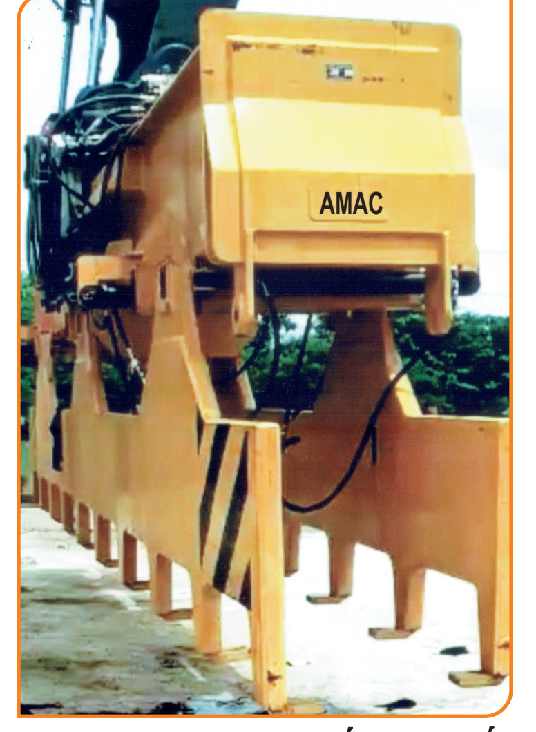
Minimum one mtr. plate width....