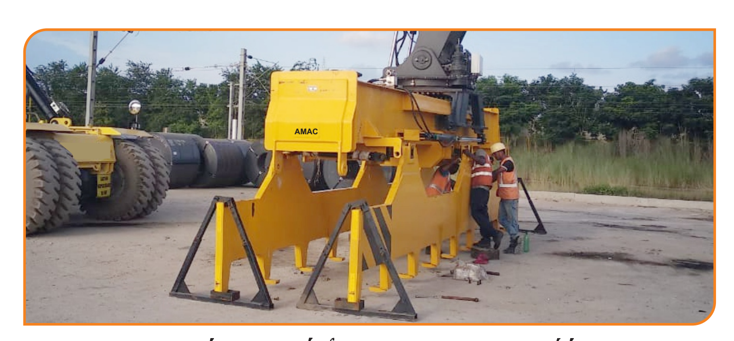
regular side shift and rotation possible for safe and ease of work