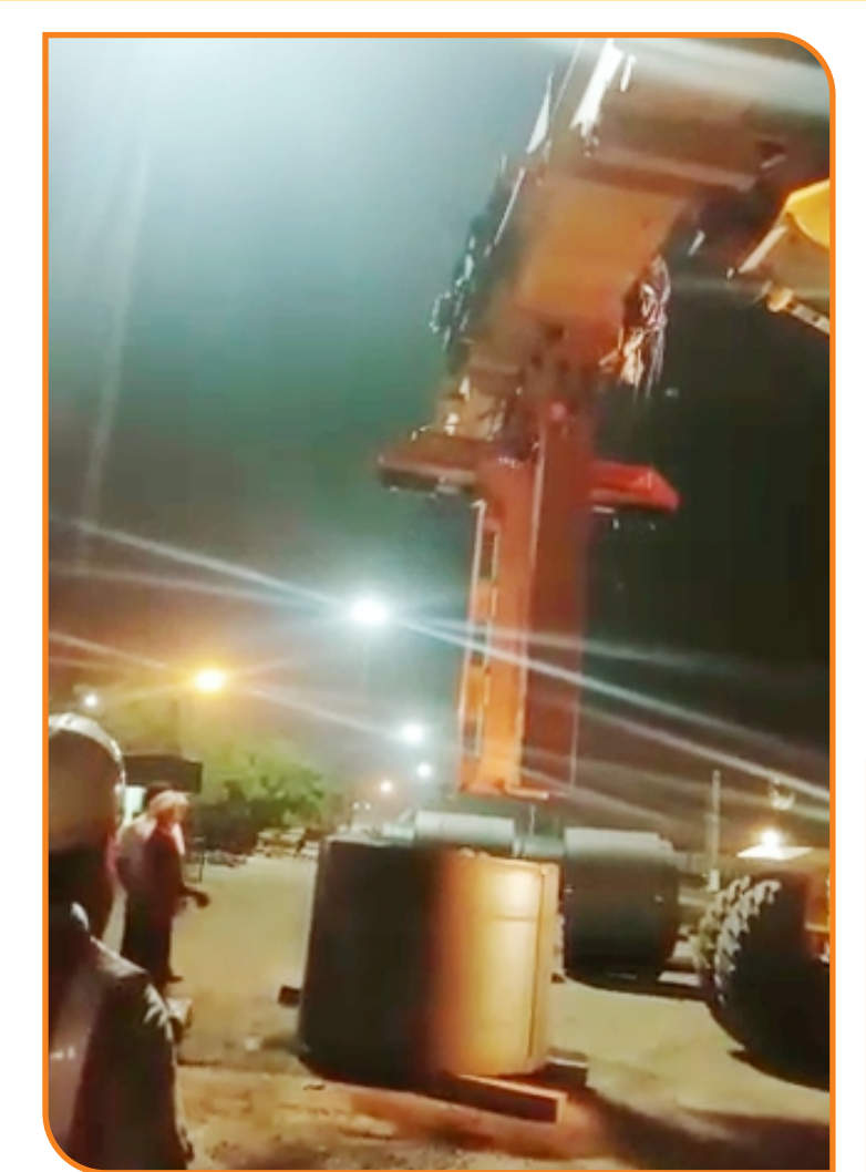
5 meter long rigid box compatible for lifting within the straddle of the rotator assembly under the slewing gear of reach stacker